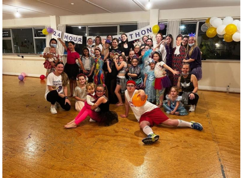
Disco Time – Dance-a-thon 2022

Jazz, hip hop, Contemporary, Tik Tok & Chorography Challenges plus lots of laughter and sweets to keep the energy up.