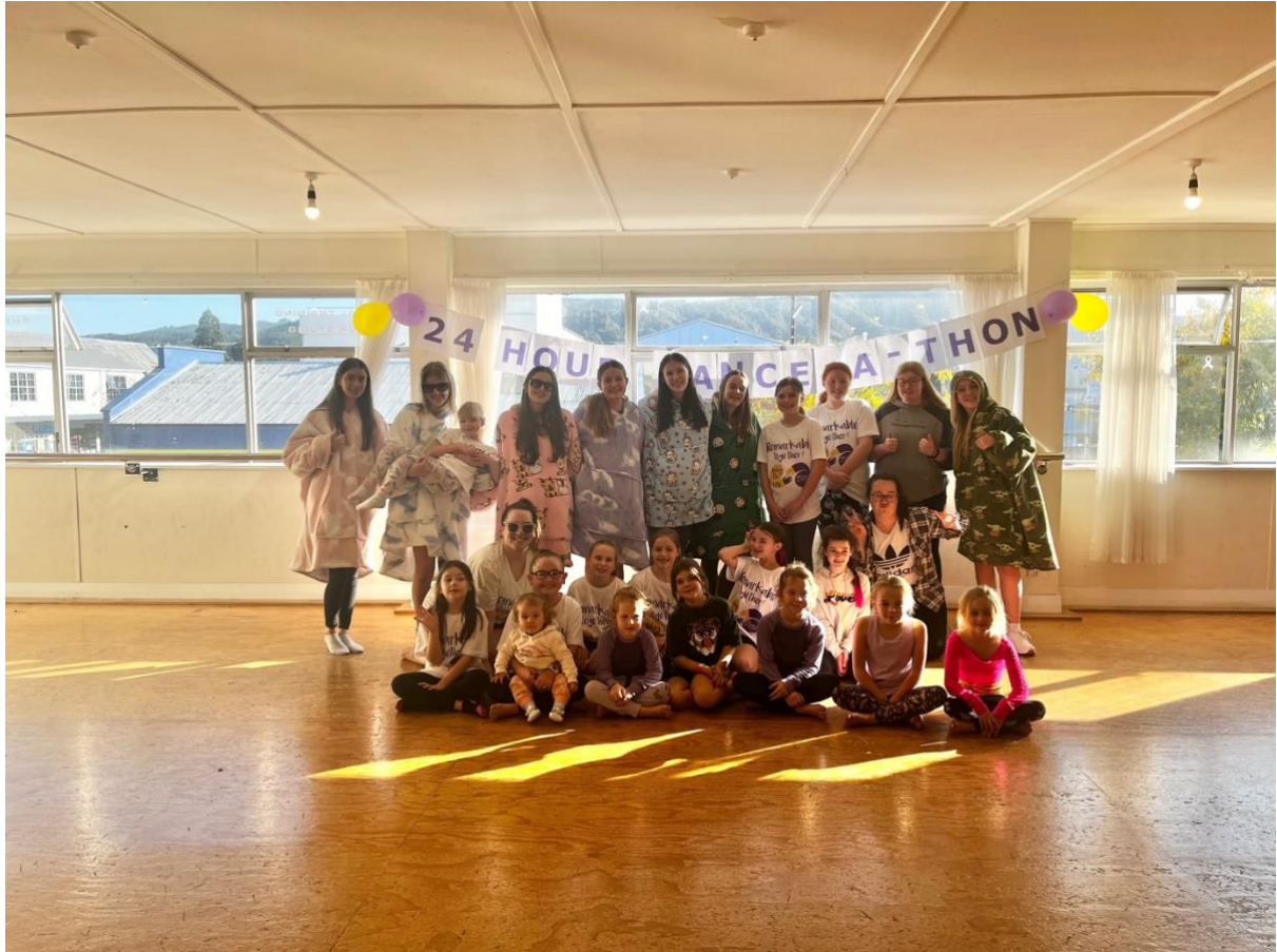
Morning Crew – Dance-a-thon 2022