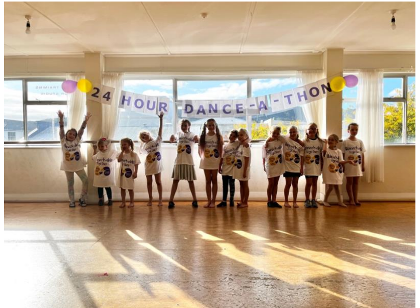
Junior Team – Dance-a-thon 2022

These girls did so well and started our Dance-a-thon off with a bang. So proud of all of these dancers. They worked well together and go to enjoy lots of loud music and some chocolate treats.