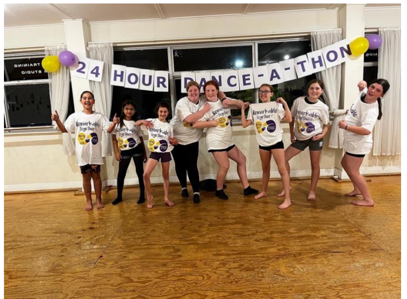
Intermediate Team – Dance-a-thon 2022

We even had some time to do some Tik Tok dancing. This was when the teachers had to step down and the dancers became the teachers. Lots of giggles were had during this time, mainly from the dancers who were trying to get the teachers to do some creative Tik Tok dances.