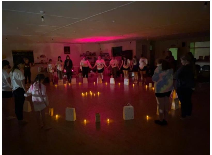
Candlelight Ceremony – Dance-a-thon