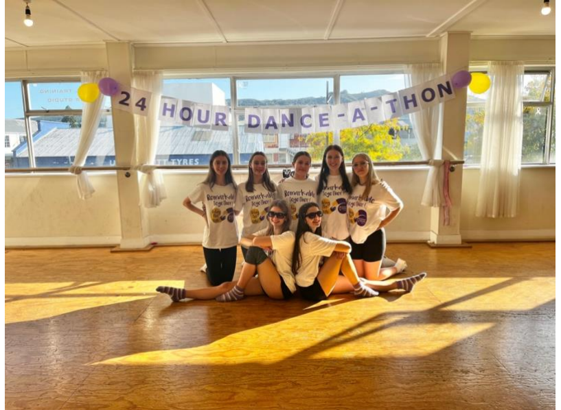
Senior Team – Dance-a-thon 2022

Pancakes (thanks Tracy) and hashbrowns plus corner work was what our 6.30am – 8.00am time slot looked like. Lots of Disney songs which turned into a mixture of all sorts of music.