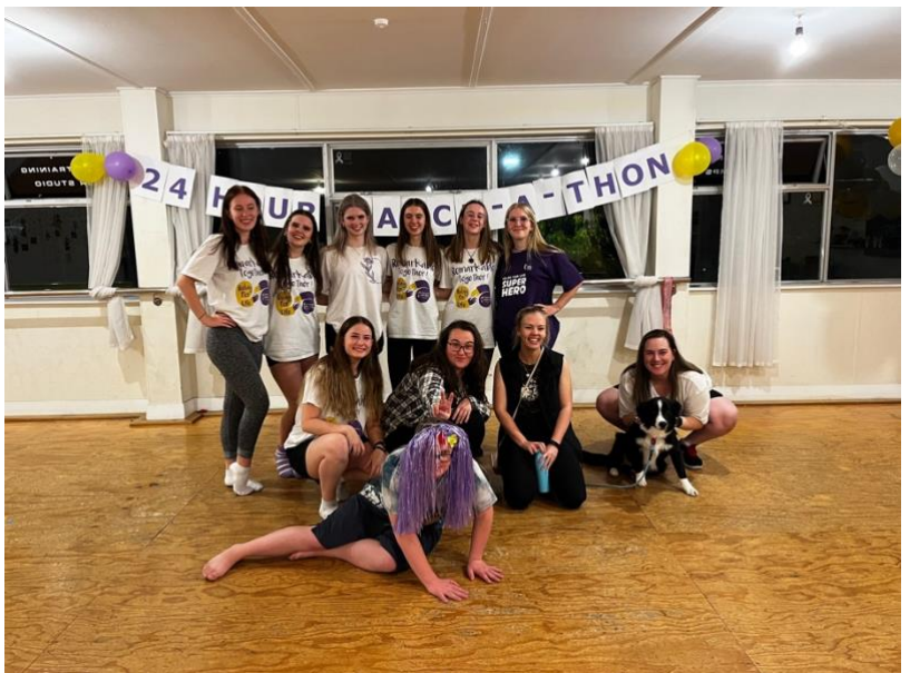
Senior Team – Dance-a-thon 2022

A great way to end the 24 hour Dance-a-thon. Encanto music, singing and lots of dancing. It was very special to have everyone together to finish us off.